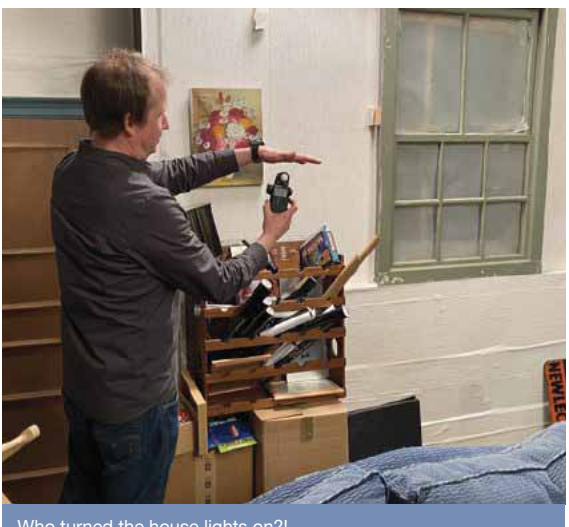
Who turned the house lights on?!