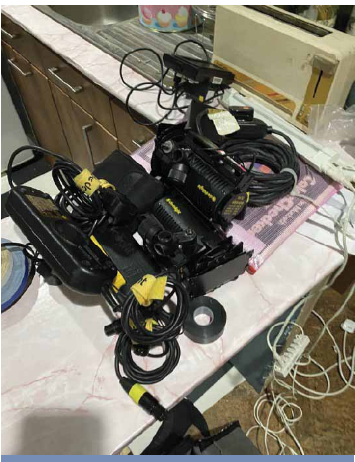
Nick, you're supposed to plug these in AND turn them on! The Prince of Darkness reigns supreme once again...

We stuffed as much as we could into the van and returned to the village. Another friend from the local pub generously let us keep all the set materials in one of his storage containers until the shoot. It definitely felt like a community was coming together to help.